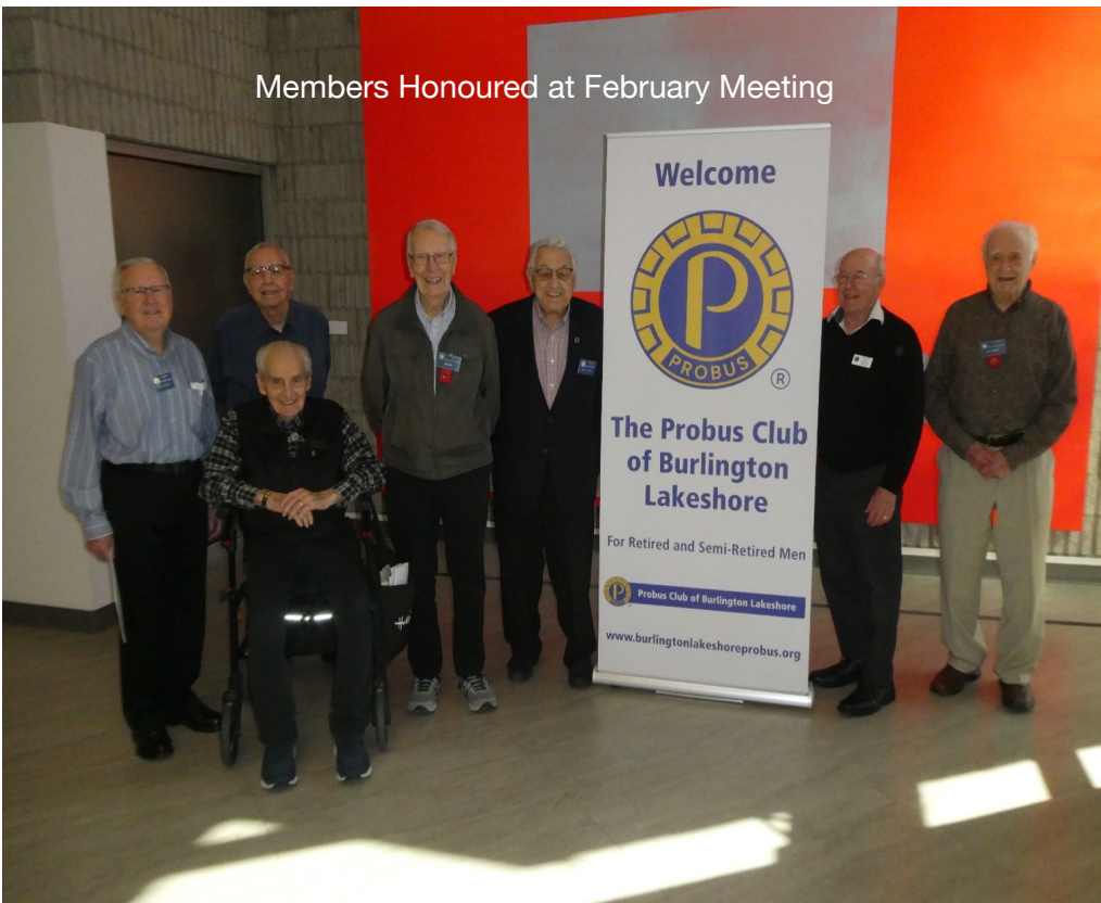
Members Honoured at February Meeting