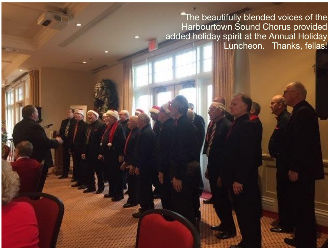
The beautifully blended voices of the Harbourtown Sound Chorus provided added holiday spirit at the Annual Holiday Luncheon. Thanks, fellas!