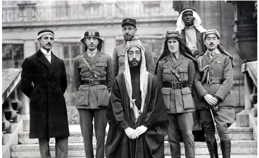
King Faisal of Iraq on the steps of Versailles at the Paris Conference at the end of the war (Lawrence is in the background)