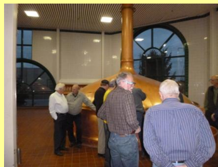
Brew Kettles at Sleeman’s Brewery

On April 22, ten of our members went for a tour of the Sleeman Brewery at Guelph. There were several interesting points that we learned there. All the Sapporo Japanese beer sold around the world except in Japan is made in Guelph (must tick off our American neighbours) and that all production is planned at least one year ahead. That must take an effort due to weather and economy taken into account.